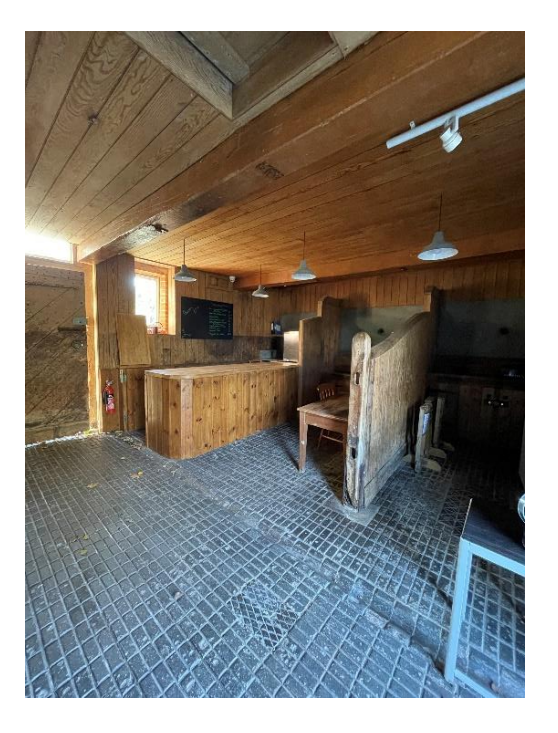
Ticket office interior