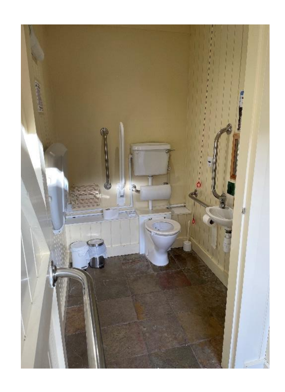
Interior of accessible WC