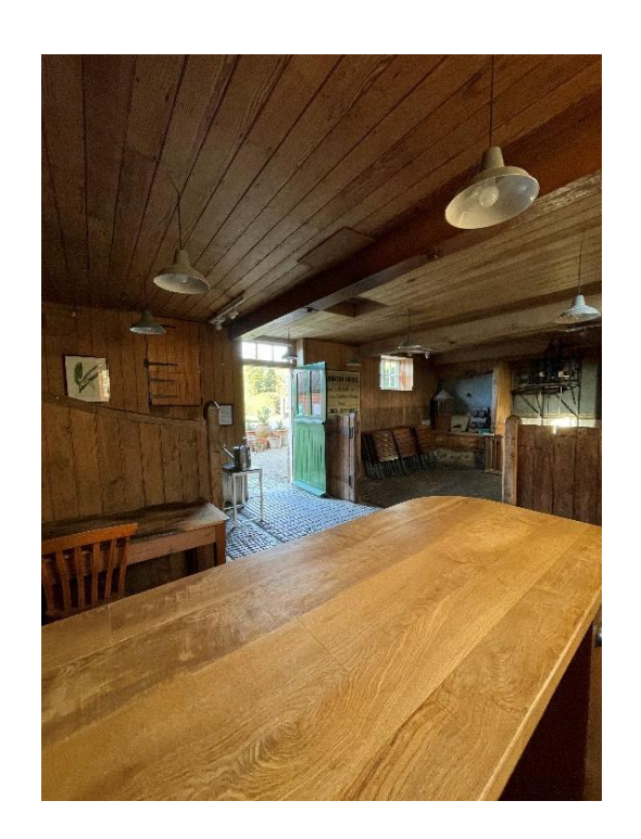
Ticket office interior