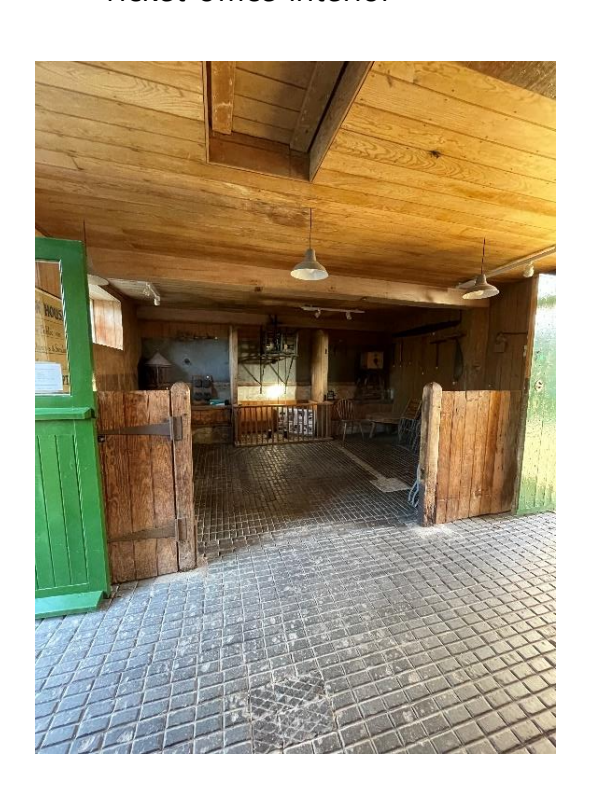
Ticket office interior