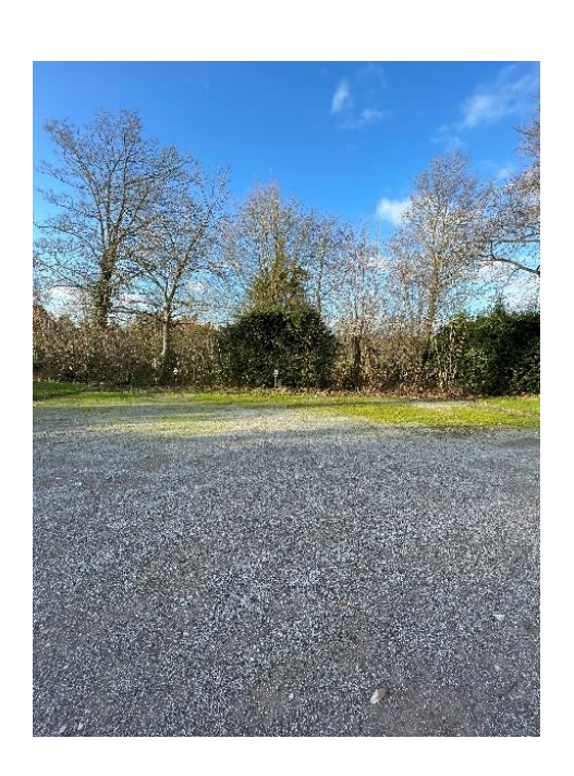
Blue Badge car parking bays