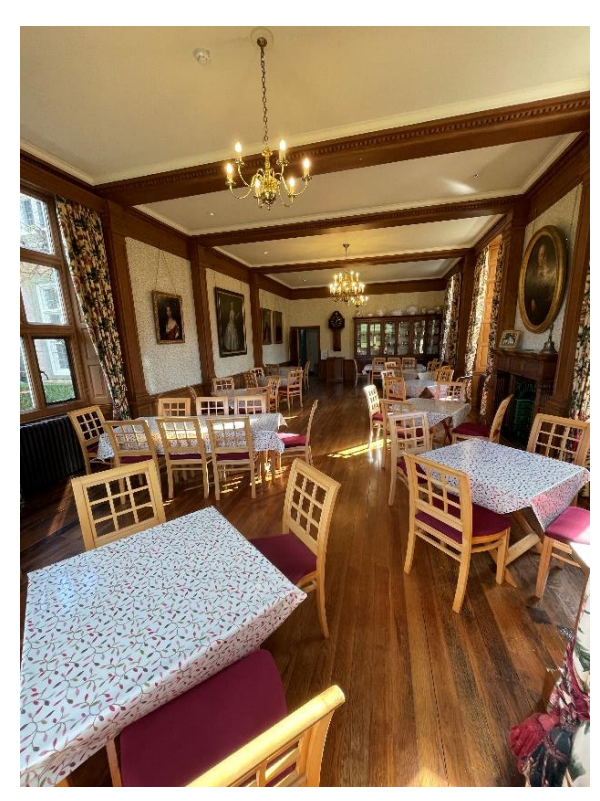
Tea Room interior