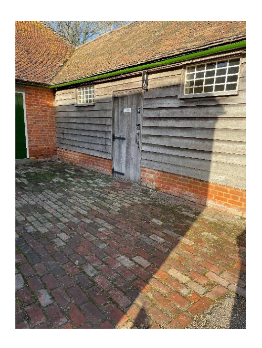
Accessible WC entrance