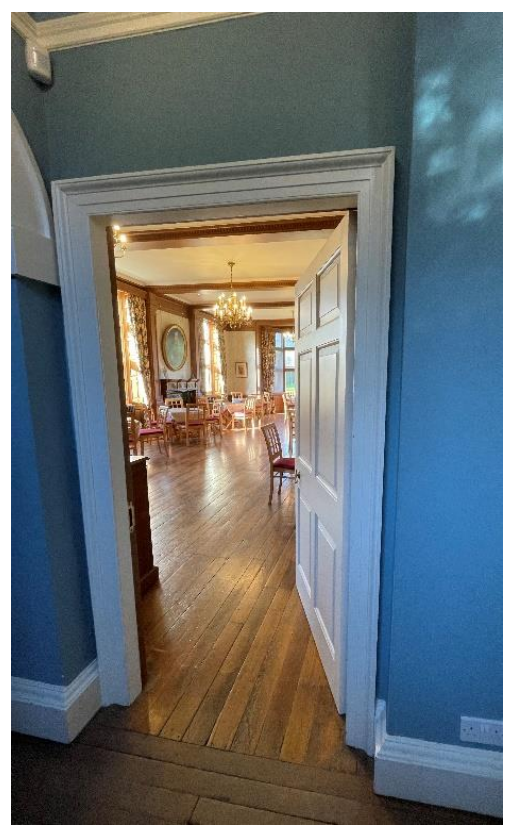
Tea Room entrance