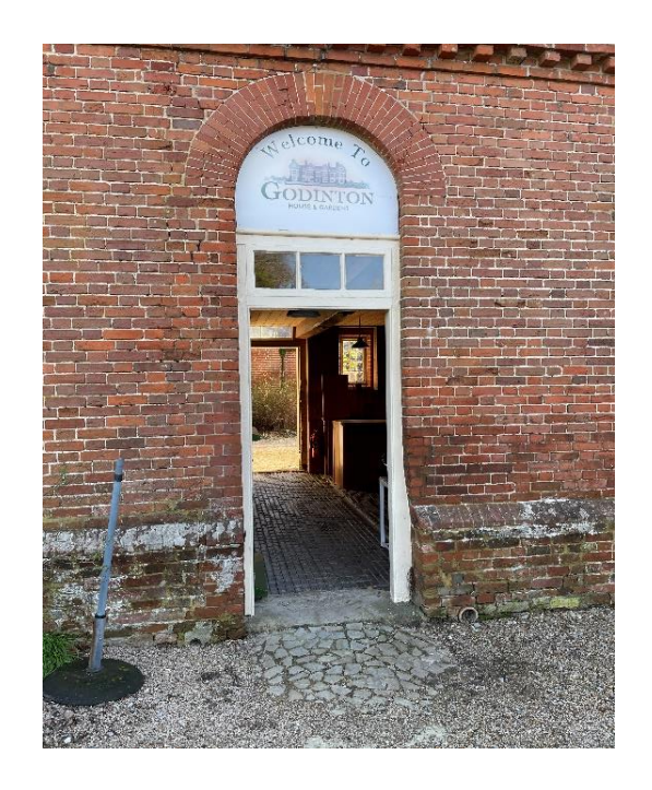
Entrance to ticket office