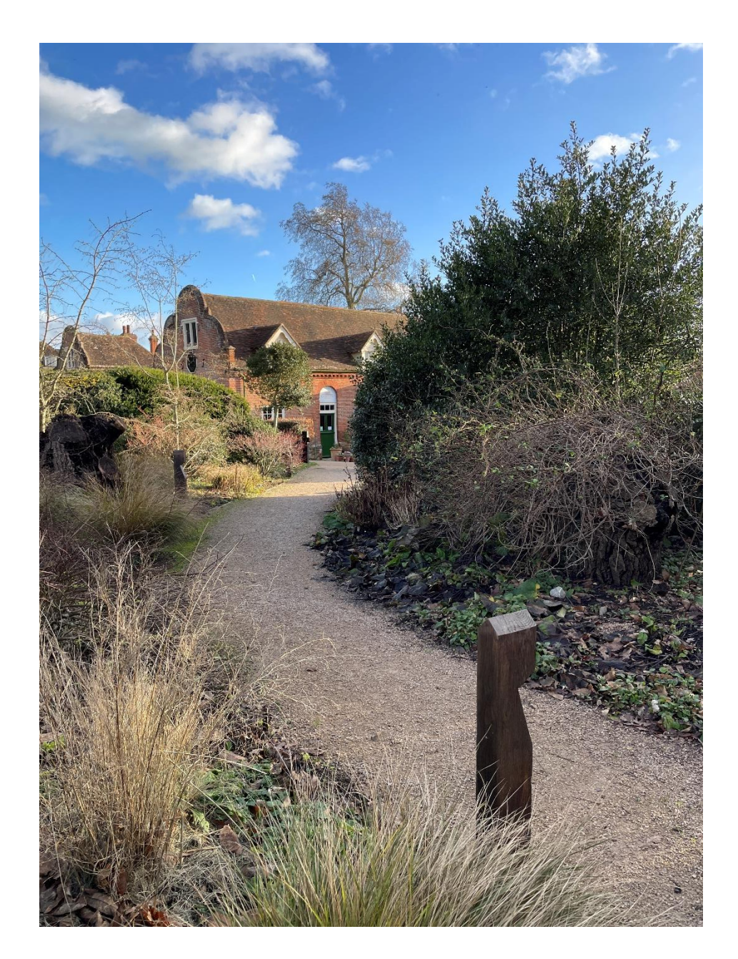
Pathway from carpark to ticket office